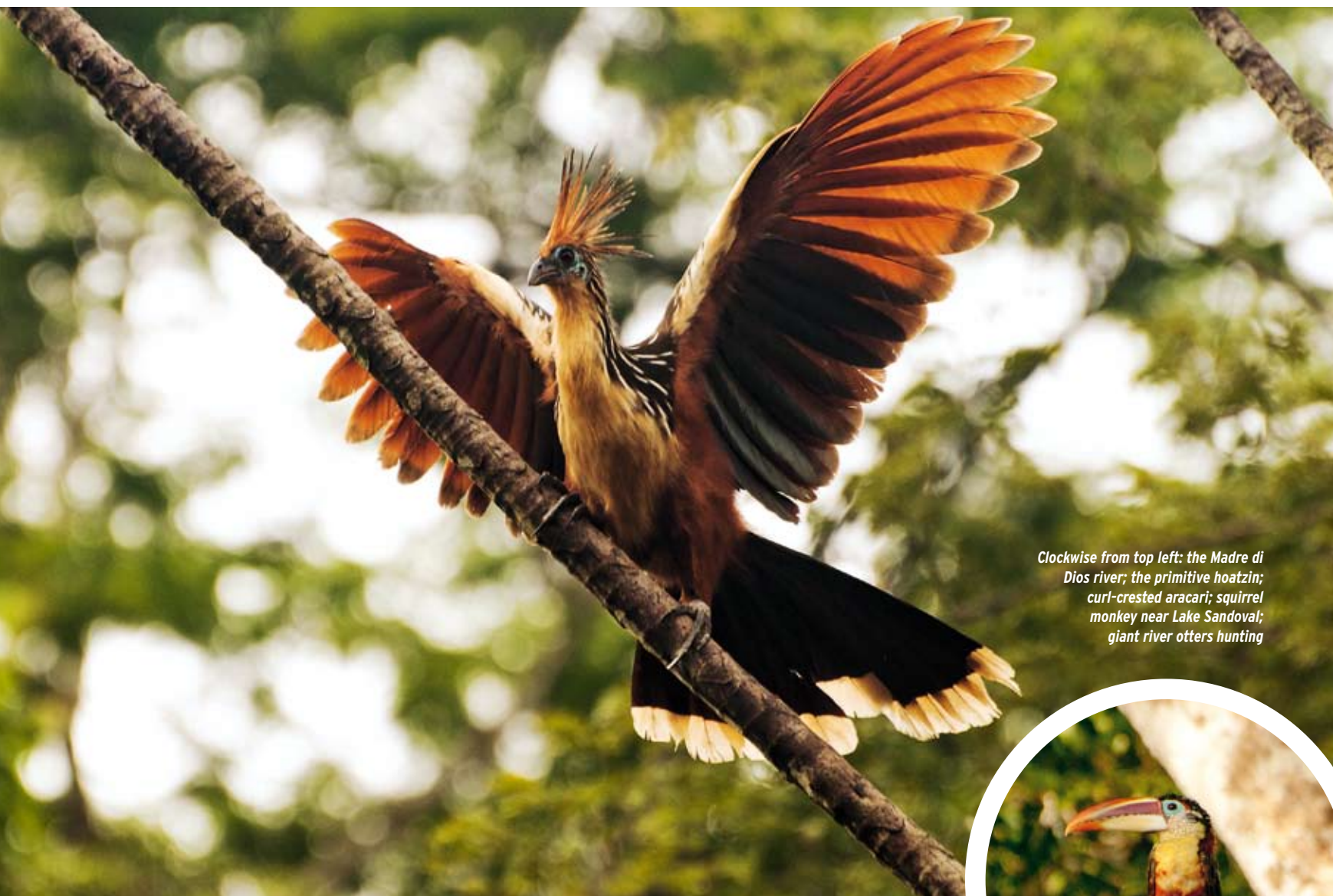
Clockwise from top left: the Madre di Dios river; the primitive hoatzin; curl-crested aracari; squirrel monkey near Lake Sandoval; giant river otters hunting